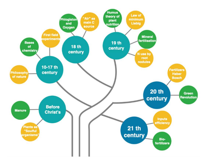
Figure 1. Evolution of some historical marks on plant nutrition.

Understanding plant nutrition is fundamental for humankind and instrumental for agriculture, and it represents a great collective effort of science, industry, technicians, and citizens. However, the history of discoveries (Figure 1) concerning the way plants feed is full of misconceptions and incorrect theories.